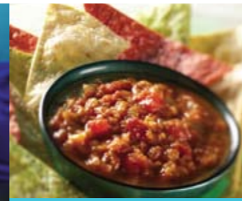
Toasted Jalapeño Tomatillo and Watermelon Salsa