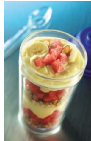
Watermelon Breakfast A Go Go

Place the frozen watermelon cube in the bottom of a chilled martini glass. Place the ice, vodka, Cointreau, grenadine and watermelon puree in a shaker and shake for 30 seconds. Strain into the glass and garnish with the skewer. Makes 1 cocktail.