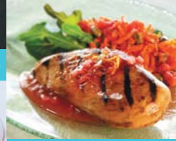
Maple Citrus Watermelon Glazed Chicken