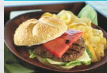
Flash-Grilled Watermelon Cheddar Burger