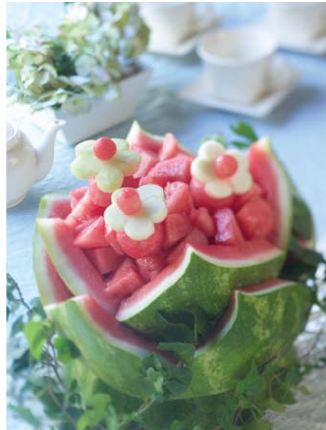
Watermelon Flower ▲ ▼ Watermelon Fish