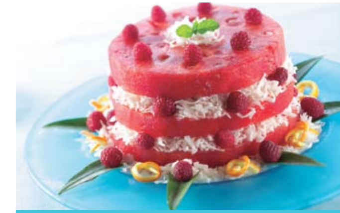
Individual Watermelon Coconut Cakes with Raspberry Filling

Grill the hamburgers almost to desired doneness, but 30 seconds before they are done, place a cheese slice atop each burger. Place the watermelon slices on the grill and dust with the pepper to taste. Assemble the burgers on the buns with a slice of warmed watermelon on each on top of the cheese.