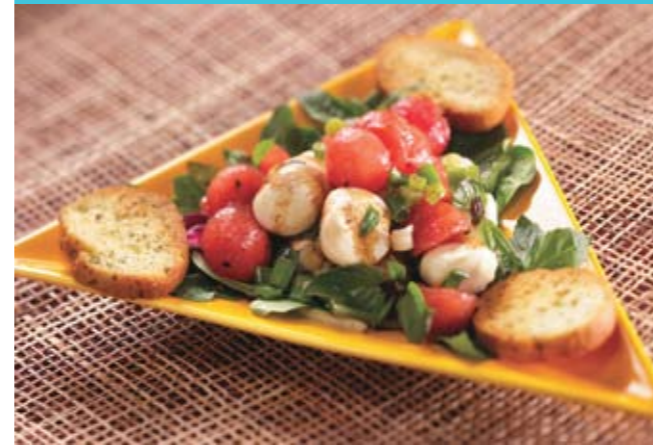
Fresh Mozzarella Watermelon Salad with Purple Basil