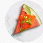
WATERMELON, SMOKED SALMON, AVOCADO & CILANTRO