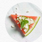
WATERMELON, FETA, CUCUMBER & MINT